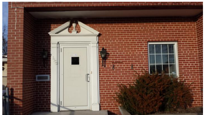
Front entrance of our new location at 1175 Madison Road in Beloit