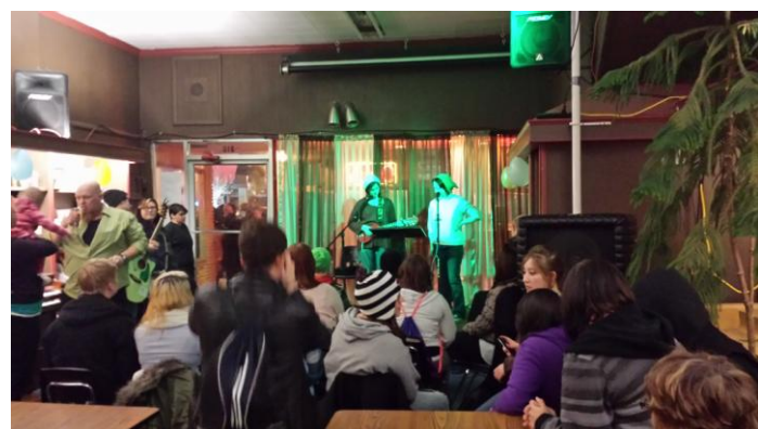
Friday night Open Mic at The Overflowing Cup (JOSHIAH'S Place Coffeehouse)